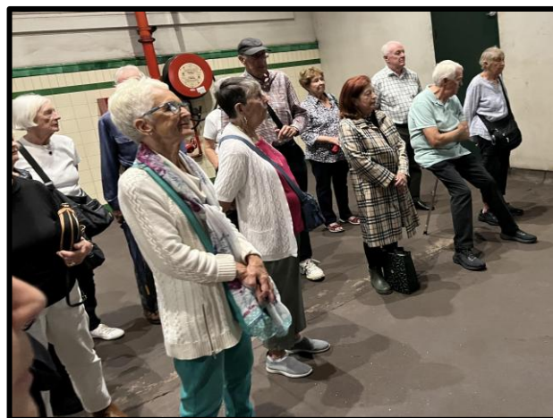
Exploring the Secrets of Central Station